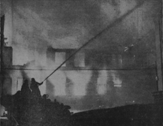
Flames which formerly burned a glass company are now burning in a garage in the basement at Poughkeepsie. Flames are seen silhouetted against houses which lighted up the night.