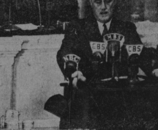
President Roosevelt's grant is reflected in the faces of Speaker William B. Bankhead (left) and Vice-President John G. Davis (right) as they are seated in the Senate and House of Representatives at Washington, D. C.

NEW YORK, Jan. 5 (AP)—Eleven thousand striking taxicab drivers are expected to report for work tomorrow under a peaceful settlement announced by Mayor LaGuardia.