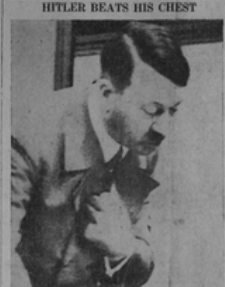
The picture, taken in London and sent to New York by Western Union... Hitler beats his chest...

50,000 Workers Tail To Post Vot Expenses In Shape For Debat