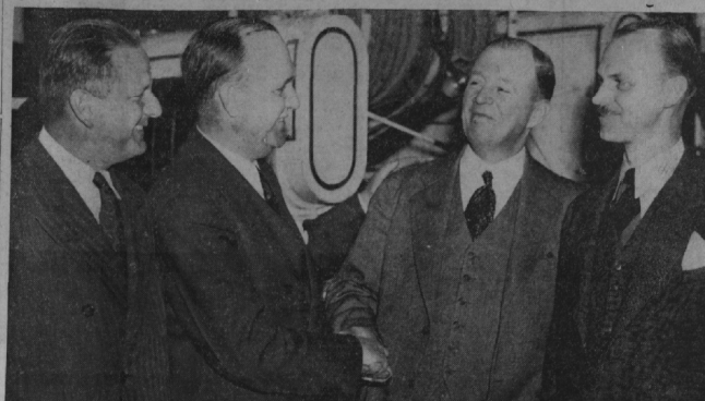
New heads of the Larchmont Village Volunteer Fire Department are shown after the annual election of last night...