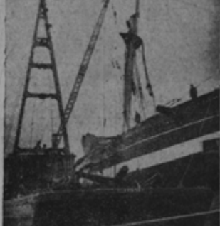
These towers of white canvas, which were used for storage of munitions during the World War, are being dismantled in the city of New York.