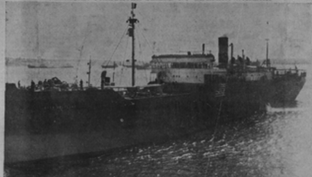
The United States is reported to demand that Russia release the U. S. Lines freighter City of Flint, which was taken to a Soviet port after its seizure by a German warship while enroute from New York to Marseilles, England. The Nazi ship's crew commandeered the freighter's crew and sailed to a Soviet port.

AMERICAN FREIGHTER SEIZED BY GERMAN WARSHIP