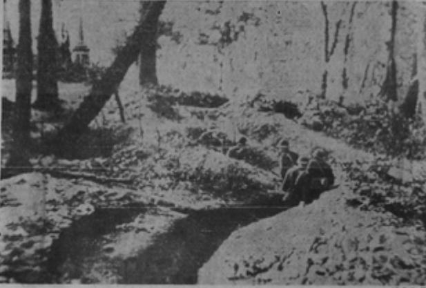
This official French photo received in New York yesterday by radio from London, here the following French command captain, "French troops moving forward through communication trench southwest to Germany, which is now French. Note the church steeple and oriental to World War dead in left background."