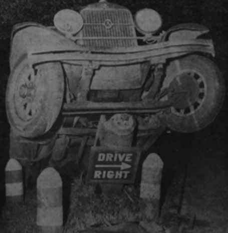
This automobile proceeding south on the New 90th Street Parkway last night headed over a shoulder and fell into the concrete barrier on the east side of the road. The car was driven by a driver who was not identified.