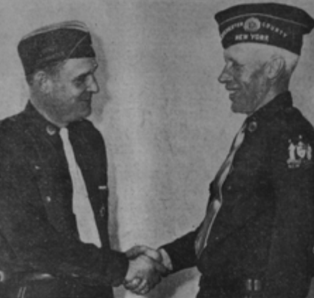
The two men, both from the American Legion, are shown in a photograph. The man on the left is the outgoing commander, and the man on the right is the incoming commander.