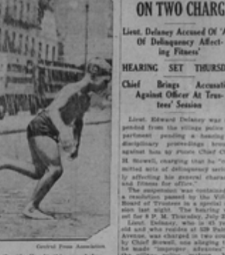
Belle of the not-so-gay attention—the sports in this case being a reference to the thermometer.