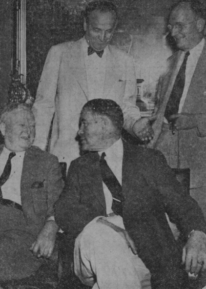
Vice-President Garner (left, seated) and Senator Alben Barkley (right, seated), new Democratic Senate members, are members of the Judiciary Committee, meeting in Washington yesterday when the future of the court bill was discussed. With them are Chairman Henry F. Ashurst (left) and Senator Burton K. Wheeler, leader of the opposition.