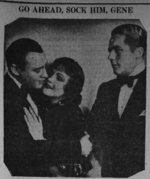
Nancy Carroll sings up to Jack Benny while Gene Raymond looks on in 'Transatlantic Merry-Go-Round,' starting tomorrow at Loew's.

LOEW'S BOB BURNS MARTHA RAYE in 'MOUNTAIN MUSIC'