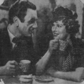
Arthur Tracy and Anna Neagle in a scene from 'Backstage' playing today and tomorrow at 3300 Theatre.