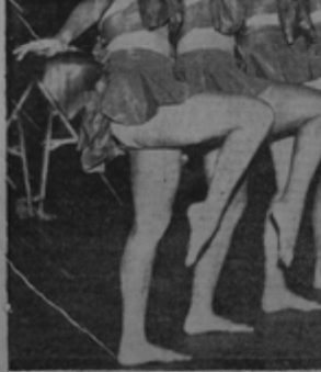
Shown in the annual program, presented at the Larchmont Country Club, were the county girls who scored a hit in the show.