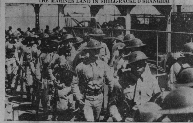
Grin-faced American marines reach Shanghai after being rushed from Manila on the S. S. President Hoover to protect American citizens in the heart of the war. This picture was flown all the way from the Philippines to New York.