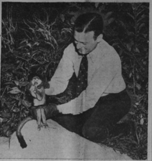
He's In The News Again! Chick, The Wandering Monkey, Finally Lured From Hiding—And He's On His Way To Zoo Now—We Hope

The new assault forced China's western defenses, and the Japanese to a new position as they shifted west. The United States Marine position in the northern boundary of the international demilitarized zone in Shanghai, however, remained unchanged. Chiang Kai-shek, the Chinese leader, said that his troops were still holding their ground in Shanghai and other Chinese cities with a backbone of British, American and other foreign troops. The first of 1,500 American troops were sent to Shanghai on Sept. 10. The first of 1,500 British troops were sent on Sept. 11. The United States Marine force was reported to be in Shanghai and other Chinese cities.