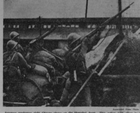
Japanese warplanes night Chinese planes on the Shanghai front, Hongkong section of Shanghai, where there has been fierce fighting.