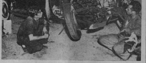
The Driver From Front View of Car Involved in Accident on Saw Mill River Road at Briarcliff Manor Last Night.