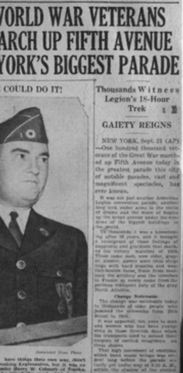
NEW YORK, Sept. 21 (AP)—The parade of World War veterans, which started at 10 o'clock this morning, was held up by a traffic jam on Broadway that stretched for a mile.

MARKET CLEARS NEW YORK, Sept. 21 (AP)—The stock market closed today with a slight gain, as investors showed confidence in the economy. The market was up 1/8 point, with the Dow Jones Industrial Average closing at 187.14. The market was up 1/8 point, with the Dow Jones Industrial Average closing at 187.14.