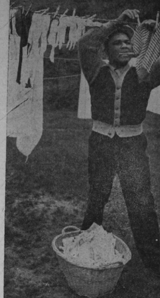
When Henry Armstrong tries to put Barney Ross on the ropes next Thursday in their battle for the lightweight title, he'll be thinking this homey little scene. But here he's merely relaxing from training routine at his Pompton Lakes, N. J., camp.