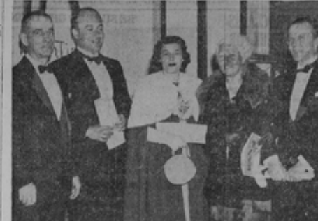
Attend Opening Music Festival Concert