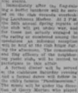
The opening phase of the Larchmont Club ...

Flag-raising at Noon Begins With Tackling Session; Social Events Planned