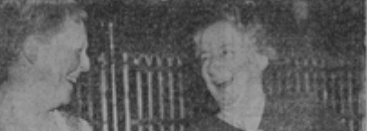
Two distinguished guests of last night's music festival concert...