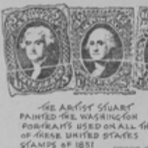
THE ARTIST'S SQUARE... PAINTED THE WASHINGTON PORTRAITS USED ON ALL THREE OF THESE UNITED STATES STAMPS OF 1851