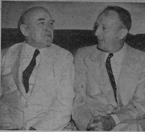
Attired in a natty white suit, Justice Hugo Black (right) of the Supreme Court, is shown with Senator John H. Bankhead of Alabama yesterday when the jurist visited the capitol to look in on the closing preparations in Congress. They talked over the times when the justice was also a senator from Alabama.