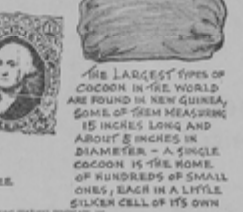
THE LARGEST TYPES OF COCOON IN THE WORLD... ARE FOUND IN NEW GUINEA... IS INCHES LONG AND ABOUT 5/8 INCHES IN DIAMETER... A SINGLE COCOON IS THE HOME OF 5000 BEETLES OF SMALL ONES... EACH IN A LITTLE SILKEN CELL OF ITS OWN