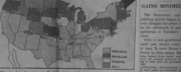
This map shows how returns in Tuesday's elections affected the political complexion of the United States. In Delaware there was no Senatorial or gubernatorial races but Republicans gained congressional seats. Montana also did not have gubernatorial or senatorial contests...