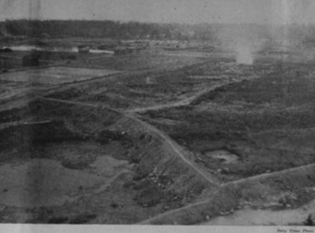
This might have been a photo of the beach-front in China, with the Great Wall in the center, but it is not—it is a picture of the area being reclaimed on Harbor Island in the Village of Mamaroneck, showing the dikes which have been completed recently.

The photo taken from the top of the County Statute Building on the Post Road, shows only a part of the more than two miles of dikes which will retain the site and other material to be dredged by United States Army engineers from the West Basin. The engineers estimate that 12,000 cubic yards of material will be taken from the basin and deposited in the low areas.