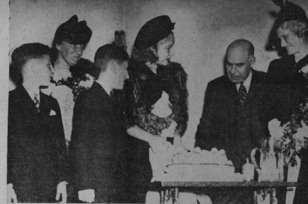
Governor Herbert H. Lehman returned to his purchase home last night in Larchmont for reelection ended, after his Harrison neighbors had greeted him with an enthusiastic rally in a local theater. Governor and Mrs. Lehman are shown above as children presented them with a white ribbon "Good Luck, Governor!"