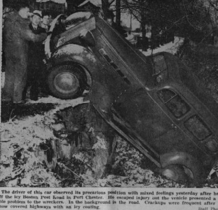
The driver of this car observed its precarious position with mixed feelings yesterday after he added off the icy Boston Post Road in Port Chester. He escaped injury but the vehicle presented a considerable problem to the wreckers...