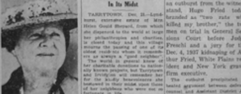
Photo of the late Mrs. Helen Gould Shepard of Tarrytown, former Mrs. Robert W. Huntington...