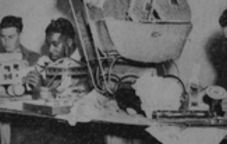
Children who might otherwise not receive dolls and toys this Christmas will receive gifts from Santa's repair shop here, where workmen are busy repairing the figure of Santa Claus. The workmen are busy repairing the figure of Santa Claus. The workmen are busy repairing the figure of Santa Claus.