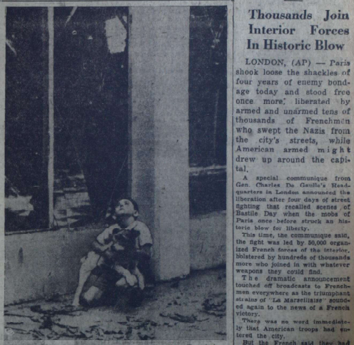
AS AMERICAN SHELLS SCREAMED overhead, a little French boy comforts his frightened dog by clasping him close on a street in St. Dinard. Although the occupation has shattered windows and raised glass down on him, the youngster, aged 8½ years, only has thoughts for his terrified animal.

The Weather This afternoon, tonight and tomorrow, some clouds with moderate temperatures. High tides today at 3:14 P. M.; tomorrow at 3:36 A. M. and 3:57 P. M.