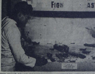
The Coast Guard technique of amphibious attack is shown in a three-dimensional display on display in Sears' Robinson's White Plains store...

Town Board Votes Increase In Police Department Pay Adding $801 To 1945 Budget