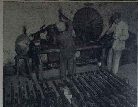
UNDERGROUND FACTORY—Chinese workers make light machine guns in an underground factory deep in the rock bowels of a mountain in southwestern China.