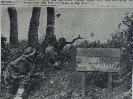
BRITISH TROOPS HEED 'SKYLINE' WARNING —Two members of the British Eighth Army peer over a hill to see a warning sign as they approach the rim of a hill on the Sangre River front in eastern Italy.