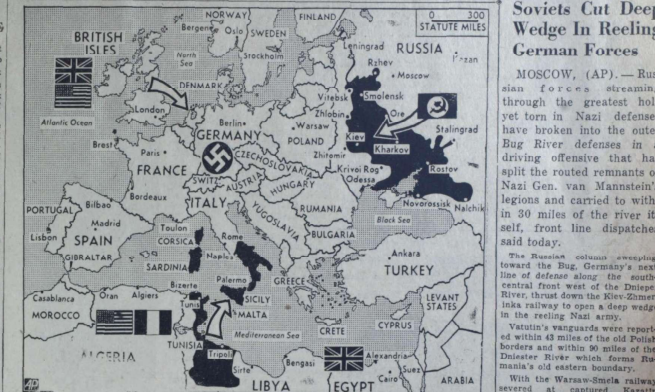
ALLIED GAINS AGAINST AXIS IN 1943 Black areas indicate territory won by the Allies in their fight against the Axis in Europe and North Africa during 1943. The much up from Africa resulted in Italy's surrender. An 1943 drive to a close. British and American forces were gathering for an attack on Germany from the west.