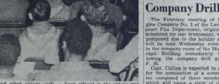
Each official in the village was replaced for the day by members of the scout organization in honor of Scout Civic Day.