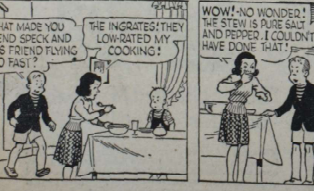
By Chic Young