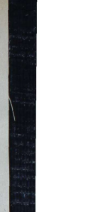
PHOTOGRAPHED AT MAMARONECK AVENUE SCHOOL GYM. A group of young men, likely athletes, are gathered around a large object, possibly a trophy or piece of equipment.

By Los Pergo. A collection of short stories or sketches, including a piece about a license and another about a man's office.