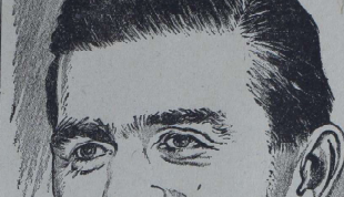
MAURICE RICHARD MADE THE NATIONAL HOCKEY LEAGUE AND MEANS TO STAY THERE.