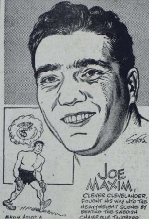
JOE MAXIM CLEVER CLEVELANDER, FIGHTER HAS WON TWO HEAVYWEIGHT SERIES BY BEATING THE SWEDISH CHAMPIONSHIP FIGHTER