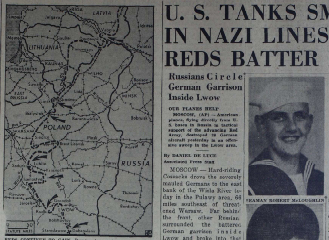
Russians Circle German Garrison Inside Lwow

WASHINGTON (AP)—The Sixth War Loan began Nov. 21, 1943 and will run for 27 months, ending Nov. 21, 1945.