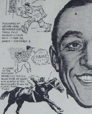
EDDIE ARCARO THE MIRACLE MAN ON A RACE HORSE