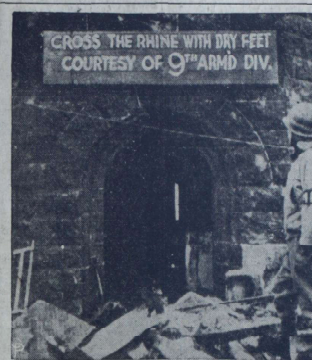
CROSS THE RHINE WITH DRY FEET COURTESY OF 9TH ARM'D DIV.