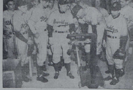
BROOKLYN DODGERS' CURT DAVIS WEIGHING IN—Leo Duracher, manager of the Brooklyn Dodgers, checks pitcher Curt R. Davis' weight before the team's Spring training at Fort Curtis, N. Y. Davis weighed the beam at 202.