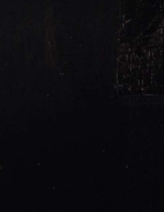
GIL COAN, who led the Southern League battlers last year with a .312 average.