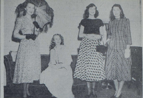
Summer styles shown during the beach and sportswear fashion show of the Ladies' Committee of Larchmont Shore Club yesterday emphasized one-piece dressmaker bathing suits and an evenly divided number of one-piece dressmaker for everyday wear.