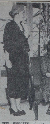
NEW OFFICERS of the Laramont Assembly are photographed above at Bonnie Briar Luncheon.