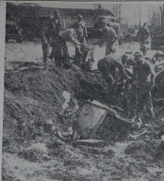
HOLE IN GROUND due to the P-47 Thunderbolt when it crashed at Westchester County Airport, Rye Lake, yesterday afternoon is searched by air-crew members.