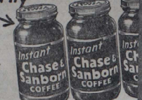
Instant Chase S Sanborn Coffee

The only "instant" backed by 85 years of coffee experience