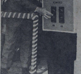
GENERAL OFFICE OF THE ARMED SERVICES DIVISION OF THE NATIONAL DEFENSE UNIVERSITY, UNIVERSITY OF CALIFORNIA, IRVINGTON-HUDSON-STAFF PHOTO

Memorial Plantings Begun On Methodist Church Grounds