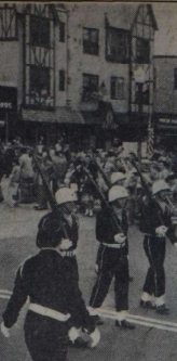
WITH MILITARY BEARING, the Larchmont Post 347 American Legion Color Guard and Rifle Squad was the lead-off unit in yesterday's Larchmont Memorial Day Parade.