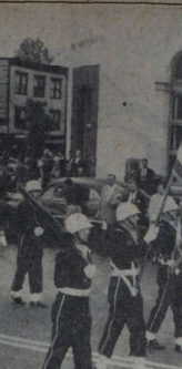
MEMORIAL DAY PARADE The line of march yesterday at the Municipal Building marched north on Larchmont Avenue to Palmer Avenue and then south across the Chateaufort Avenue bridge before services of honor and tribute at the War Memorial.