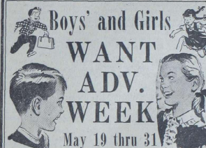
Boys and Girls