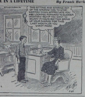
THIS BITTING AND STAINING OUT OF THE WINDOW MAKES YOU ASK YOURSELF...

Boats - Service - Accessories section with various listings.