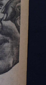
BLENDED WHISKEY 86 PROOF, 65% GRAIN NEUTRAL SPIRITS. SCHENLEY DISTRIBUTORS, INC., NEW YORK, N. Y.