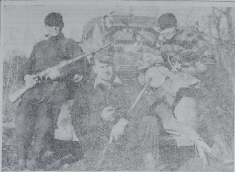
A PRIZE BAG of three deer was the evidence of successful hunting brought home recently from the Catskill Mountains by three Rook, Mamaroneck contractors. Stretched out on the fenders of the car are a seven-point, 29-pounder; a four-point, 16-pounder; and a three-point, 13-pounder. They were bagged near Livingston Manor in Sullivan County.