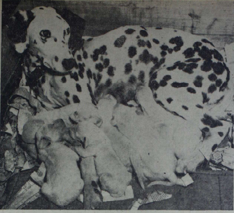
STEPSY, 10-month mascot of the North End Laddie Company of Eastchester is shown with her litter of 19 pups, seven of which are male.

MEMBER FEDERAL DEPOSIT INSURANCE CORPORATION... Founded in 1905