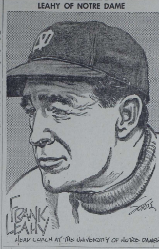
FRANK LEAHY HEAD COACH AT THE UNIVERSITY OF NOTRE DAME

BANQUETS: Accommodate from 20 to 3000. Includes: Banquet, Conference, Cocktail Parties, Reception, etc. GLEN ISLAND: Golf Course, Clubhouse, etc.