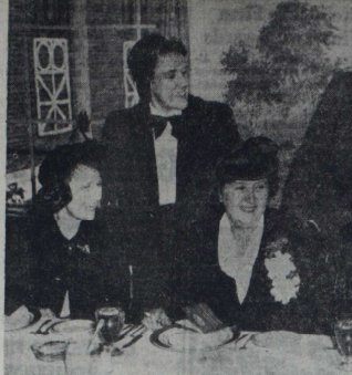
Members of the Executive Board of the League of Women...