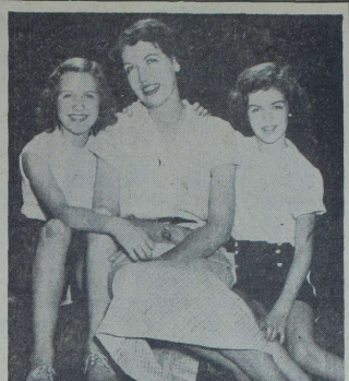
CHAMPION of suburban life in general, and life in Larchmont in particular, Phyllis McGinley, whose newest collection of poems is published today as "A Short Walk From the Station."