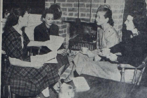
Members of the Mamaroneck High School Speech Arts Department in costumes worn in the production of "High Ground" at the high school auditorium.