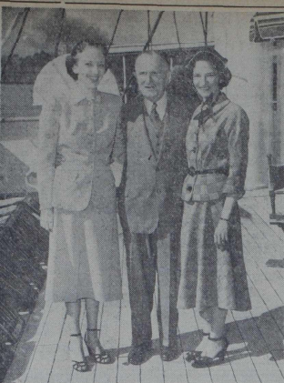
HOME BRIEFLY from a Caribbean cruise before sailing tomorrow for Rio on the Uruguay... The dance will be held at 8 P. M. at the Mamaroneck Junior High School...