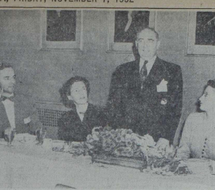
LUNCHEON at the Orienta Beach Club with the Mamaroneck High School PTA as host group... The dance will be held at 8 P. M. at the Mamaroneck Junior High School...