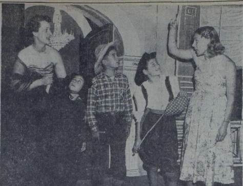
"I WISH TONIGHT" will be presented twice tomorrow in the Chatham Avenue School auditorium, at 3:15 P. M. for students and at 8:15 P. M. for parents and friends, under the auspices of the Parent-Teacher Association...