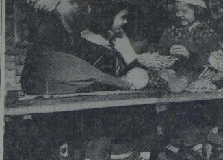
THANKSGIVING for the "Indians" of the pre-kindergarten and kindergarten groups at Orienta School, Mamaroneck, four of whom are pictured above, is being celebrated this week at the school as a climax to the Fall program of native traditions...