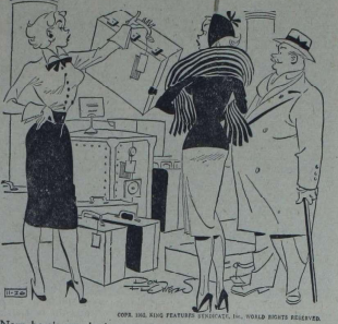
"Now, here's one that's unusually light-weight, so you put clothes in it."

Positions Wanted, Male MAMARONECK 9-2100