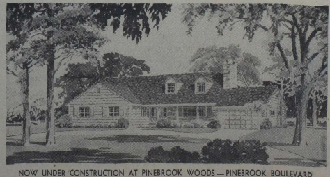
NOW UNDER CONSTRUCTION AT PINEBROOK WOODS—PINEBROOK BOULEVARD

It will feature a master bedroom of 15.6 x 13.10 with private bath; two other bedrooms of 16.4 x 11.7 plus two unfinished rooms and bath on second floor; center entrance hall; 13.10 x 23 living room with fireplace; 14.7 x 11.10 dining room; 18 x 11.10 kitchen with washer and dryer; recessed gas hot water heat; open stairway; overhead garage doors; full basement with laundry; Pennsylvania slate roof; brass plumbing and split shingle siding; wire lath and plaster throughout. . . This house is available.