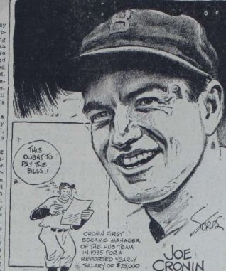
JOE CRONIN PIITCHER OF THE BOSTON RED SOX, SIGNED UP FOR ANOTHER THREE YEARS