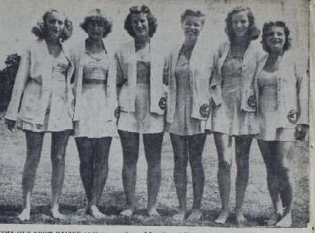
TIME OUT FROM RAISING as three members of Larchmont Shore Club girls' swimming team...