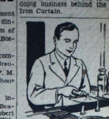
TO THE LETTERS When a physician prescribes medicine, his written orders are followed by us to "T."

The driver, who was injured in a car accident in Philadelphia yesterday, was hospitalized for several days.