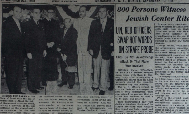
800 Persons Witness Jewish Center Rites

ESTABLISHED OCT. 1925 MAMARONECK, N. Y., MONDAY, SEPTEMBER 10, 1951