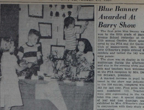
MEMBERS of the fifth grade at Barry Avenue School, participating in a social gathering at the PTA and the Garden Club of Mamaroneck, are shown above preparing to receive visitors.