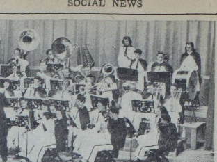
"STRIKE UP THE BAND" Members of the 70 piece combined bands of the Mamaroneck Junior and Senior High Schools are at the auditorium last night for the concert.

The Shore Club will hold a social evening on Wednesday night. The program will include a dinner and entertainment.