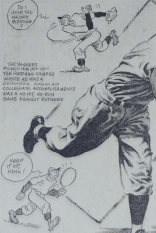
HANK BOROWY A FULL-FLEDGED NEW YORK YANKEE AFTER THREE SEASONS WITH THE NEWARK BEARS