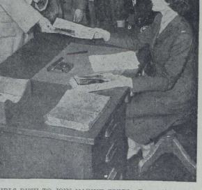
Twentieth Girl Scout troops are planning an informal mid-winter Court of Awards for the week of Feb. 27 through 30.