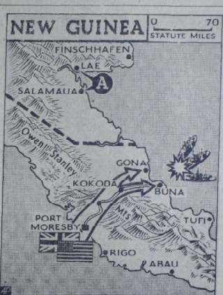
UNITED NATIONS' troops (open arrow) yesterday captured Buna, less than a week after taking Gona. Allied Air Forces started a key by (open arrow) to reinforce Buna. With the Allies' capture of Buna-Gona area, Salamaua and Lae (A) are only remaining Jap bases in New Guinea.