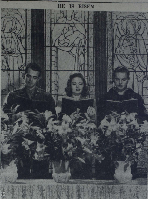
HE IS RISEN

SPECIAL EXERCISES have been arranged in all Mamaroneck and Larchmont Churches for tomorrow. Detailed programs will be found on Pages 4 and 5.