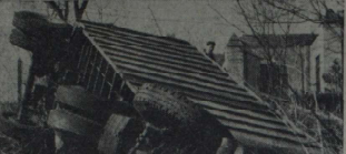
THIS IS HOW a ten-ton trailer truck wound up after rolling over the Redox, Post Road near Dillon Road, Town, early yesterday morning. The vehicle crashed through a concrete wall and returned to a 45-degree tilt. The driver was in a nearby refreshment stand and had left the truck parked at the curb—no thought he had.

THE WEATHER This afternoon, cool with winds freshening moderately. Tonight, cooler than last night with temperature slightly below freezing in the caverns. Moderate to fresh winds off shore. Star lights at 7:55. PRICE FIVE CENTS