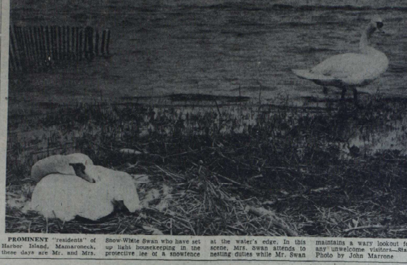
White Swan who have set up light bookkeeping in the scene, Mrs. Swan stands to the right while Mr. Swan maintains a wary lookout for any unwelcome visitors.