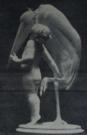
THE SECRET — One of many captives in the bank, the eyes of the leather arrangement. One day he spoke to the curator about it and learned that the reason the bird appeared in the zoo was that it was two years to complete.

MAMARONECK, N. Y., THURSDAY, AUGUST 12, 1948