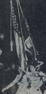
Inspection parade of the Tarrytown Fire Department last night.