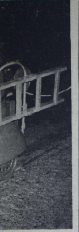
Inspection parade of the Tarrytown Fire Department last night.