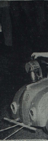
Inspection parade of the Tarrytown Fire Department. Little Blue Fire Engine is in the foreground.