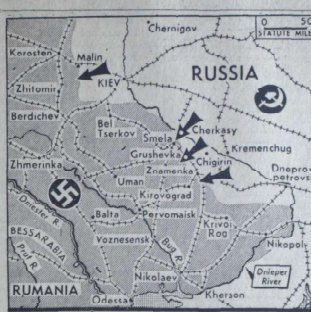
Russian troops take Chernykh—Arrows indicate direction of Red Army drives against the Nazis, highlighted by capture of Chernykh and continued advances on Kiev.

LONDON, (AP)—Nazi Field Marshal von Manstein's armoured divisions were within 50 miles of Kiev today after rolling through the highway junction at Radomysl, but 200 miles to the south.