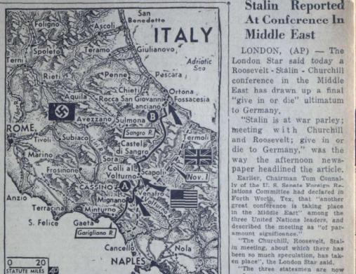
WHERE GERMAN RETREAT IN ITALY. Arrows indicate retreat from the Italian front where reports are advancing, with Germans reported retreating on the Adriatic coast (D). British captured Rocca San Giovanni and Americans penetrated German defenses at Spigno and attacked west of Venafro. Germans appeared to be preparing to abandon Cassino (A).

Stalin is at war parley; meeting with Churchill and Roosevelt; give in or die to Germany.