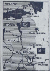
RED ARMY paratroops, according to French dispatches, have landed in the Baltic states (1) in support of the Red Army's offensive in the first phase of their winter offensive. Their drive on Vitebsk (2) continues and they are reported to have advanced to within 10 miles of the city.

The daylight caravan of American B-24 Superfortresses, as well as other light and heavy aircraft, made last Christmas shoppers in South England stop in their tracks and stare skyward.