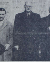
WAR FUND officials stand before Larchmont's Honor Roll, listing the names of men in uniform who will share in the benefits of the annual Red Cross drive to raise a quota of $4,500. The collection by March 1 of one-third of the quota has been set as Larchmont's immediate goal.