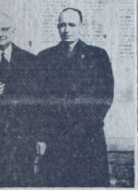
WAR FUND officials stand before Larchmont's Honor Roll, listing the names of men in uniform who will share in the benefits of the annual Red Cross drive to raise a quota of $4,500. The collection by March 1 of one-third of the quota has been set as Larchmont's immediate goal.

CHAMBER OF COMMERCE The Mamaroneck Chamber of Commerce will host Monday night its annual meeting at the Village Post War Planning Committee at a dinner meeting at 7 P. M. at the Elks Club.