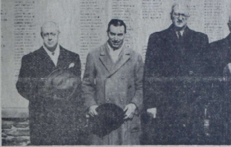
WAR FUND officials stand before Larchmont's Honor Roll, listing the names of men in uniform who will share in the benefits of the annual Red Cross drive to raise a quota of $4,500. The collection by March 1 of one-third of the quota has been set as Larchmont's immediate goal.