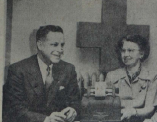
SETTING UP THE machinery for the collecting, billing and accounting of contributions was the annual Red Cross drive held under way in Larchmont.

Manager Moves to Protect 'Backyards' of Old-Time Residents To forestall unexpected construction of apartment houses in the 'backyards' of the village's old-time residents.