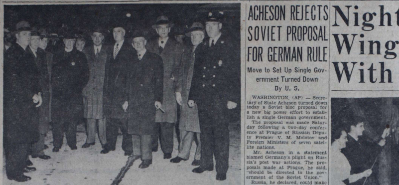
Town Fire Dept. Wins Praise At Fourth Annual Inspection Parade through the streets of the unincorporated area which were lighted by the glow of red flares.

ESTABLISHED OCT. 1, 1925 MAMARONECK AND LARCHMONT MAMARONECK, N. Y., WEDNESDAY, OCTOBER 25, 1950