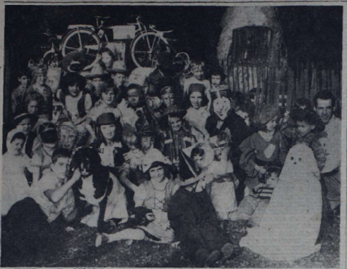
WITCHES AND GOBLINS with a generous sprinkling of cowboys and skeletons milled through Columbus Park yesterday to enjoy the third annual Halloween party sponsored by the G. I. Civic Association.

11:10 A. M. Westchester County Airport temperature 70 yesterday 65, highest 65, visibility nine miles; wind west at four mph. High tide today at 1:15 P. M. tomorrow at 1:47 A. M. and 1:30 P. M.