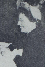
SMILING PROMISOR at the Winged Foot bridge yesterday afternoon