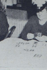
SMILING PROMISOR at the Winged Foot bridge yesterday afternoon