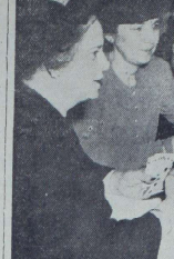
SMILING PROMISOR at the Winged Foot bridge yesterday afternoon