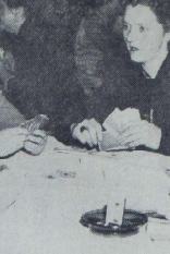
SMILING PROMISOR at the Winged Foot bridge yesterday afternoon