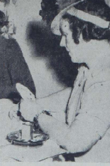
SMILING PROMISOR at the Winged Foot bridge yesterday afternoon