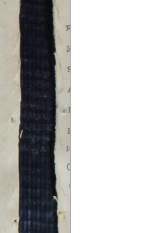
SMILING PROMISOR at the Winged Foot bridge yesterday afternoon