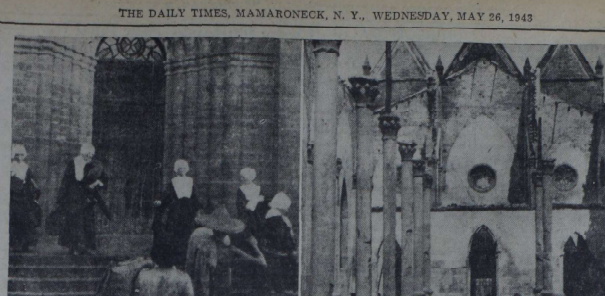
THESE AMERICAN SISTERS of Charity were photographed in the picture at left, as they left the Yonkers Mission Church to face to the hills when they received word that a revengeful army of Japanese was approaching to play, burn and loot in reprisal for the aid given by the Chinese to the American sisters who bombed Tokyo.