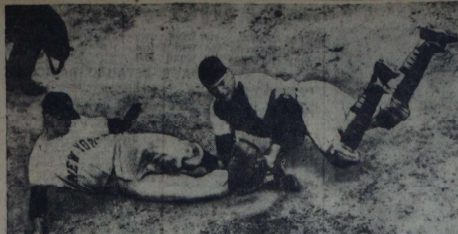
NEW YORK GIANT outfielder Don Mueller barely beats the ball the plate for an inside-the-park home run in the 18-7 victory over the Detroit Tigers yesterday at Lakeland, Fla. Catcher Frank House of Detroit dives for the summer after the relay from Vic Wertz to Gerry Prydz.